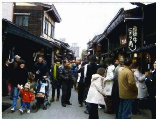
Old Private Houses