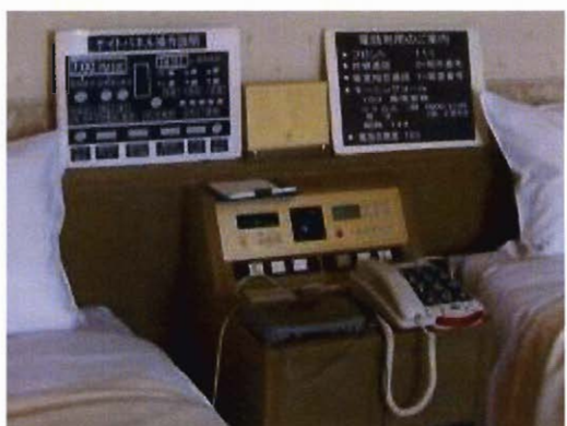
High contrast hotel room for low-vision users