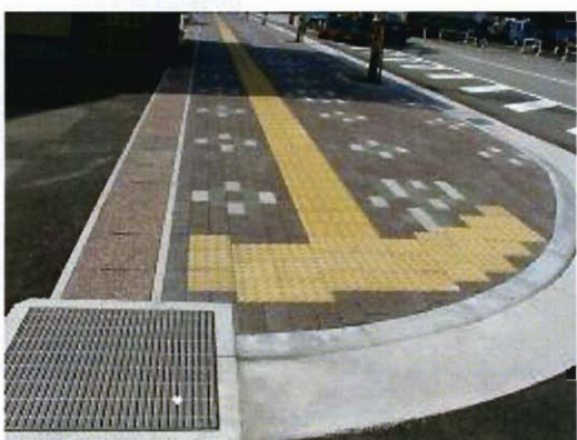
Grating and guidance blocks