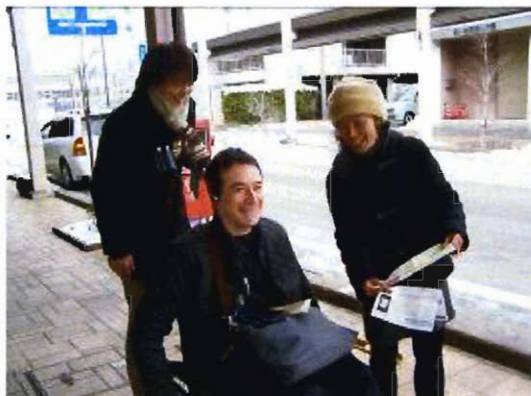
Accessibility Audit Tour in action