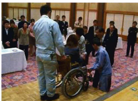
Accessibility training for tourism operators