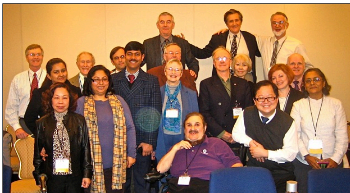
Supporters from many countries met in Washington, DC, this past January to review plans for this September's TRANSED conference.