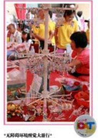
Canvoy to create awareness on disabled friendly facilities